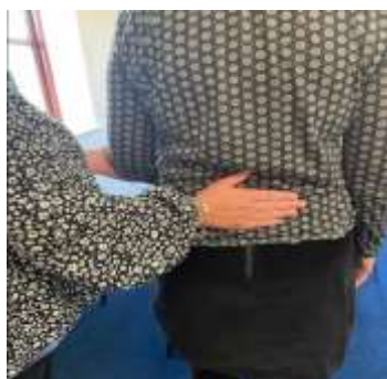
Reference: Guiding 3