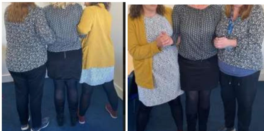
Reference: Double cup hold 5