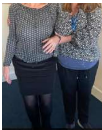
Reference: Escort 4