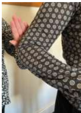
Reference: Prompting 1