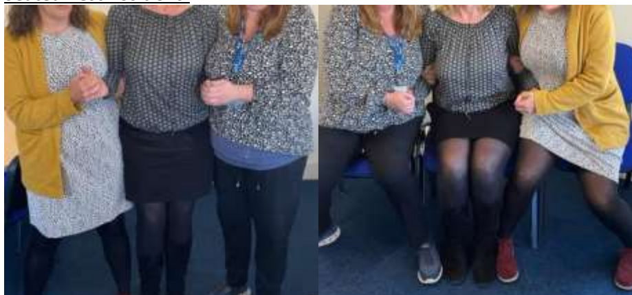
Reference: Seated rest position 7