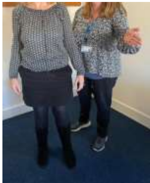
Reference: Prompting 2