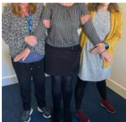
Reference: Straight arm immobilisation 6